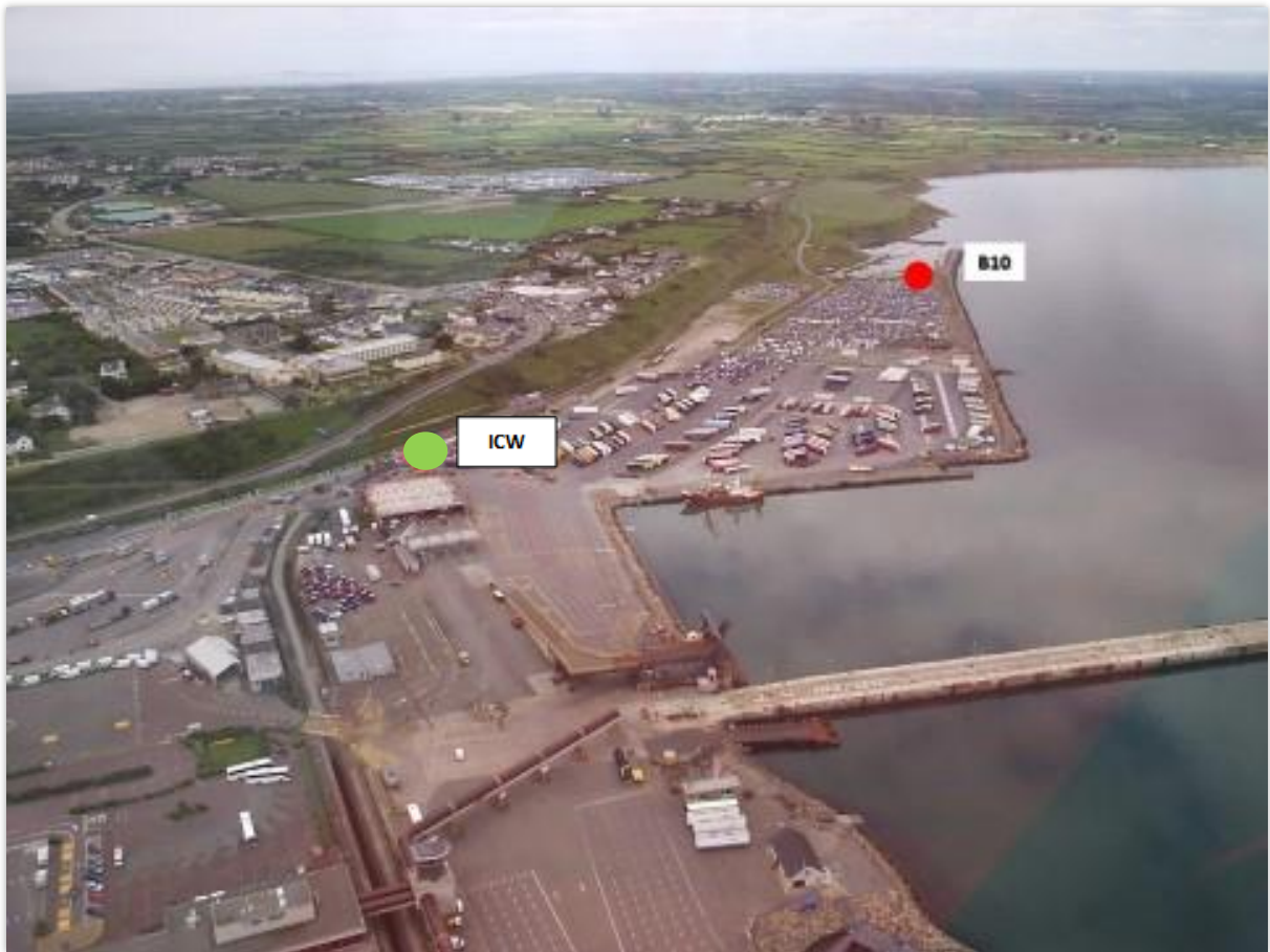
Figure 2: Small Boat Waste Harbour Facility

Figure 1 and 2 outline the general facility for small boats, yachts and Fishermen to put waste ashore at the Small Boat Harbour [B10] and also the location of the ICW skip.